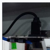
Automatic air blowing